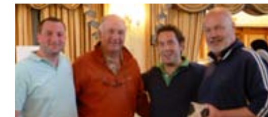
Second Place Team