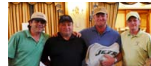
Third Place Team