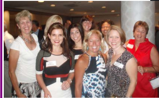
Dinner Cruise on the Intercoastal